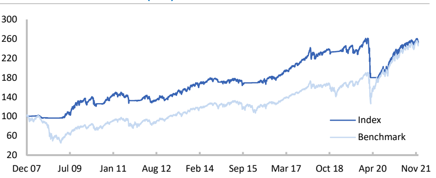
Performance<sup>1, 2</sup> – Total Return (USD)

On the specified monthly determination date, the allocation of each Sub-index is determined based on the observation of a pre-defined Tactical Trigger: the relevant daily moving average (DMA). If a specific ETF that tracks the relevant market (indicated on page 3) is at or above its relevant DMA (a bullish trend), the Sub-Index will allocate to equity via the relevant futures contract plus the Federal Funds rate (to replicate the total return) <u>or</u> only to the Federal Funds rate if the ETF is below its relevant DMA (a bearish trend).