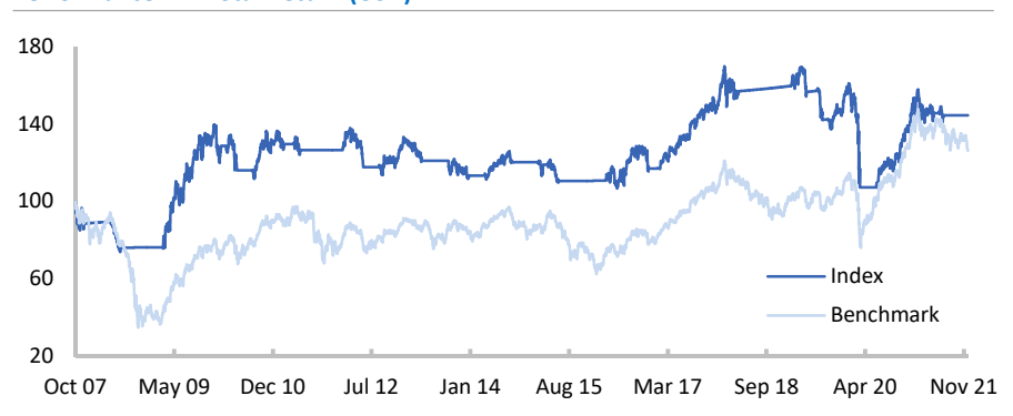
Performance<sup>1, 2</sup> – Total Return (USD)

On the specified monthly determination date, if the ETF is at or above its 100 DMA (a bullish trend), the Index will allocate to equity via the MSCI Emerging Markets futures contract plus the Federal Funds rate (to replicate the total return) <u>or</u> only to the Federal Funds rate if the ETF is below its relevant 100 DMA (a bearish trend).