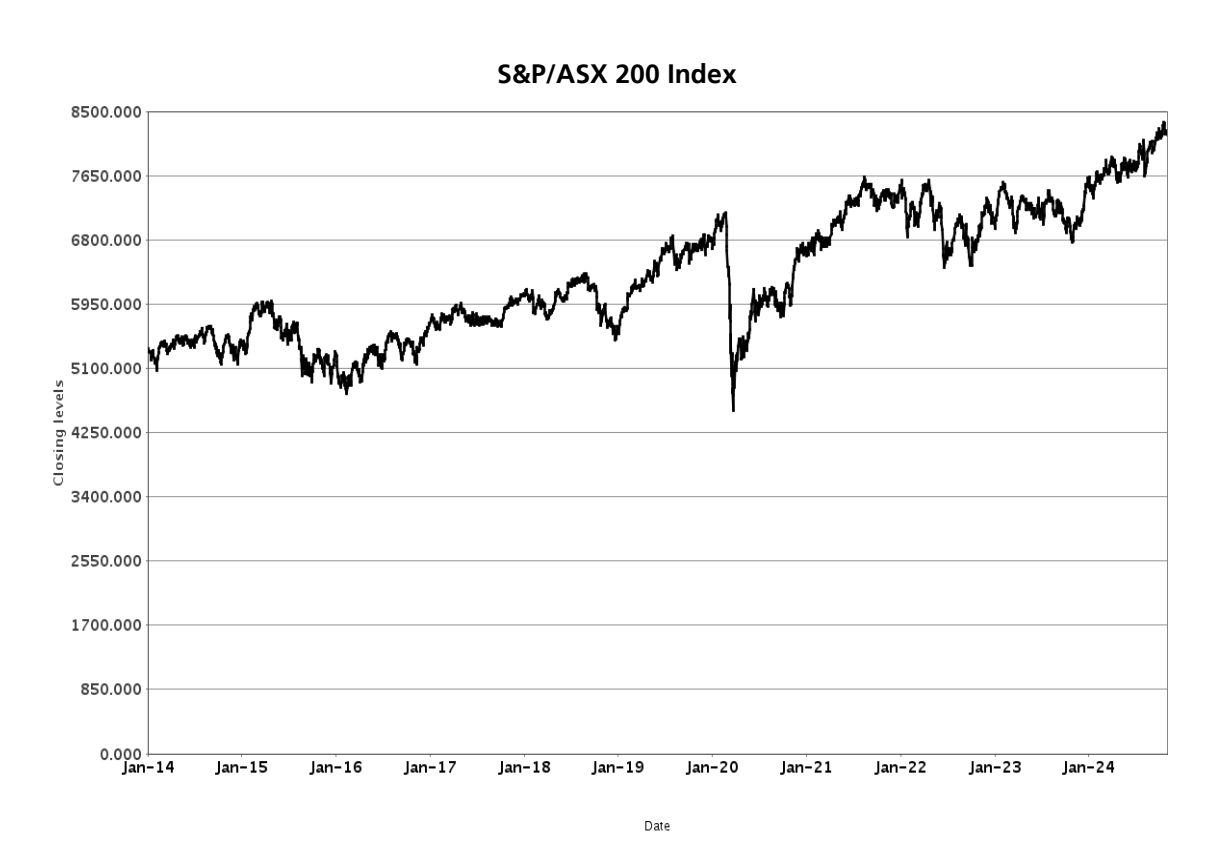
PAST PERFORMANCE IS NOT INDICATIVE OF FUTURE RESULTS.