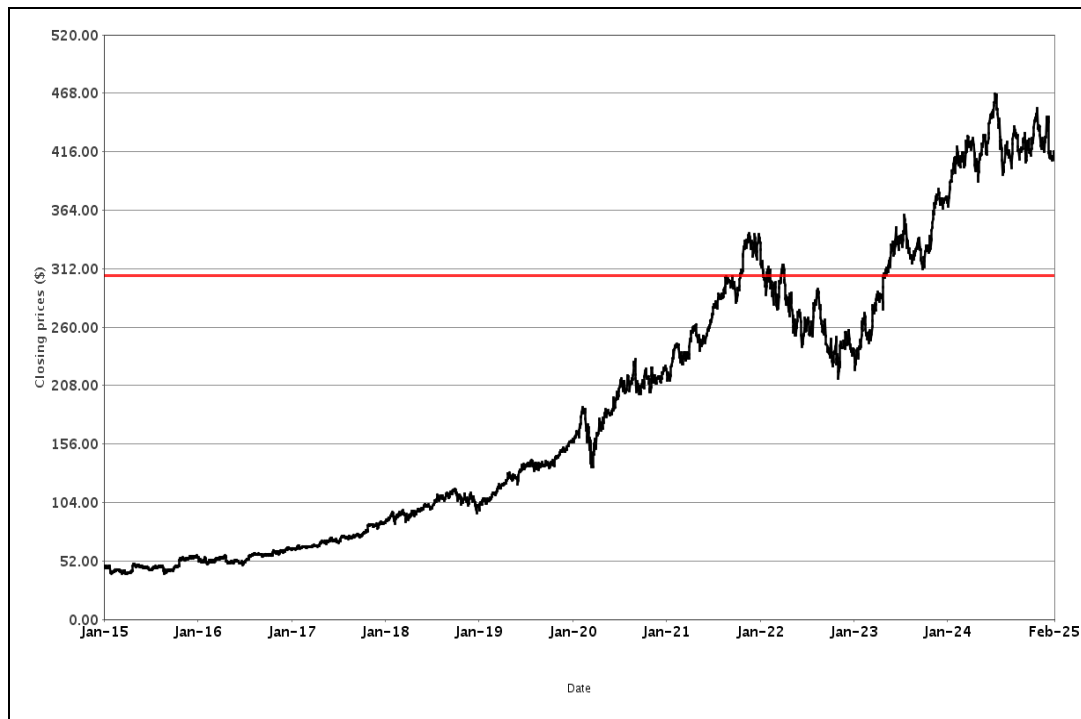
Common Stock of Microsoft Corporation

PAST PERFORMANCE IS NOT INDICATIVE OF FUTURE RESULTS.