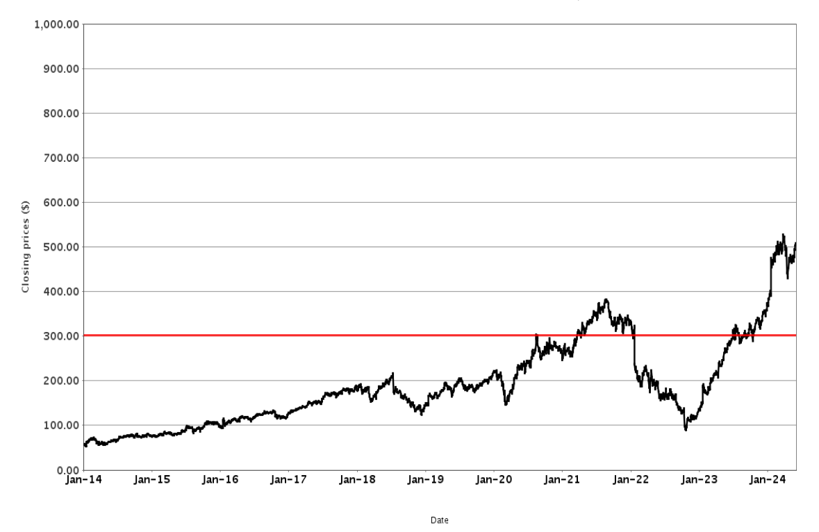
Class A Common Stock of Meta Platforms, Inc.

PAST PERFORMANCE IS NOT INDICATIVE OF FUTURE RESULTS.