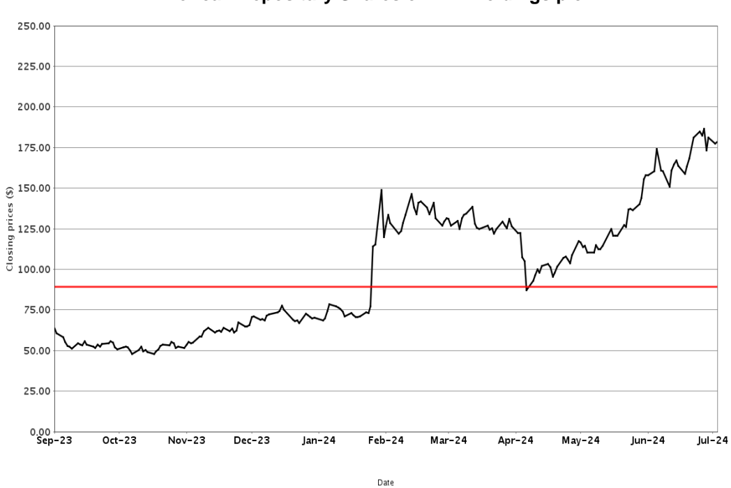
PAST PERFORMANCE IS NOT INDICATIVE OF FUTURE RESULTS.

American Depositary Shares of Arm Holdings plc