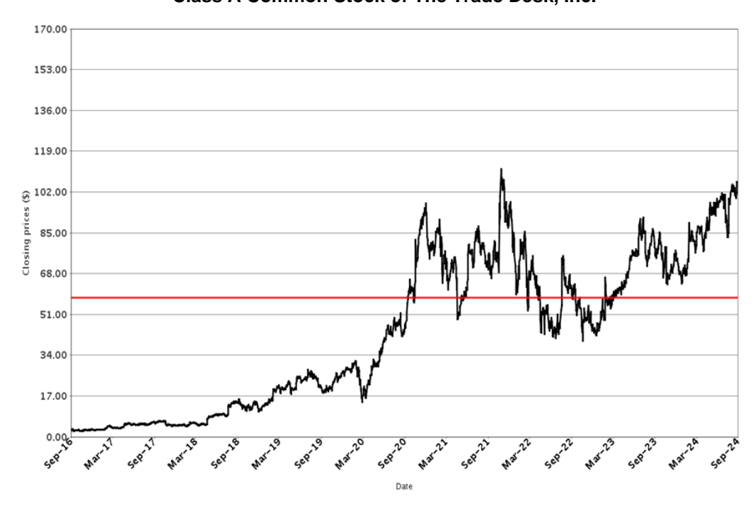
PAST PERFORMANCE IS NOT INDICATIVE OF FUTURE RESULTS.