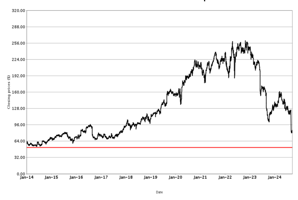
PAST PERFORMANCE IS NOT INDICATIVE OF FUTURE RESULTS.