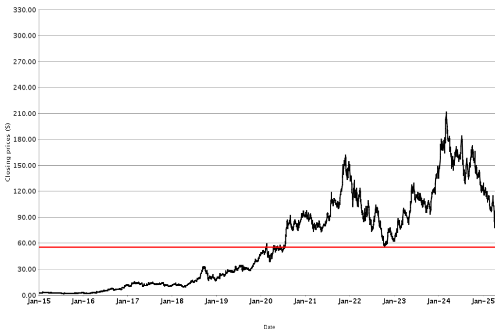
Common Stock of Advanced Micro Devices, Inc.

PAST PERFORMANCE IS NOT INDICATIVE OF FUTURE RESULTS.