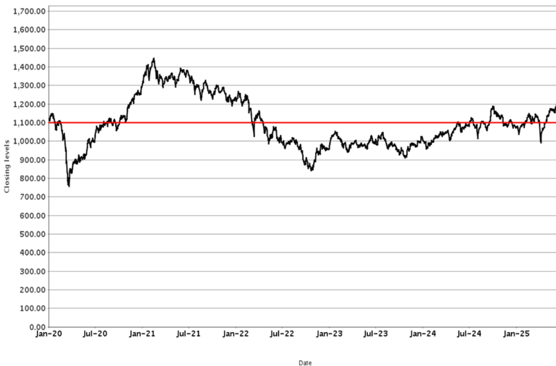
The MSCI Emerging Markets Index — Historical Closing Values January 2, 2020 to June 30, 2025

The red line in the graph above represents the trigger value.