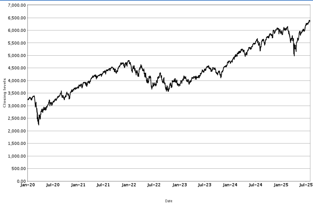
The S&P 500® Index – Historical Closing Values January 2, 2020 to July 31, 2025