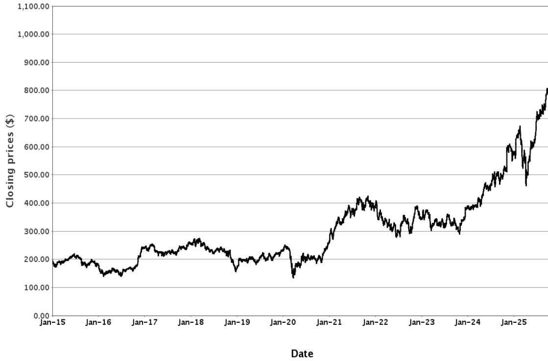
Common Stock of The Goldman Sachs Group, Inc.

PAST PERFORMANCE IS NOT INDICATIVE OF FUTURE RESULTS.