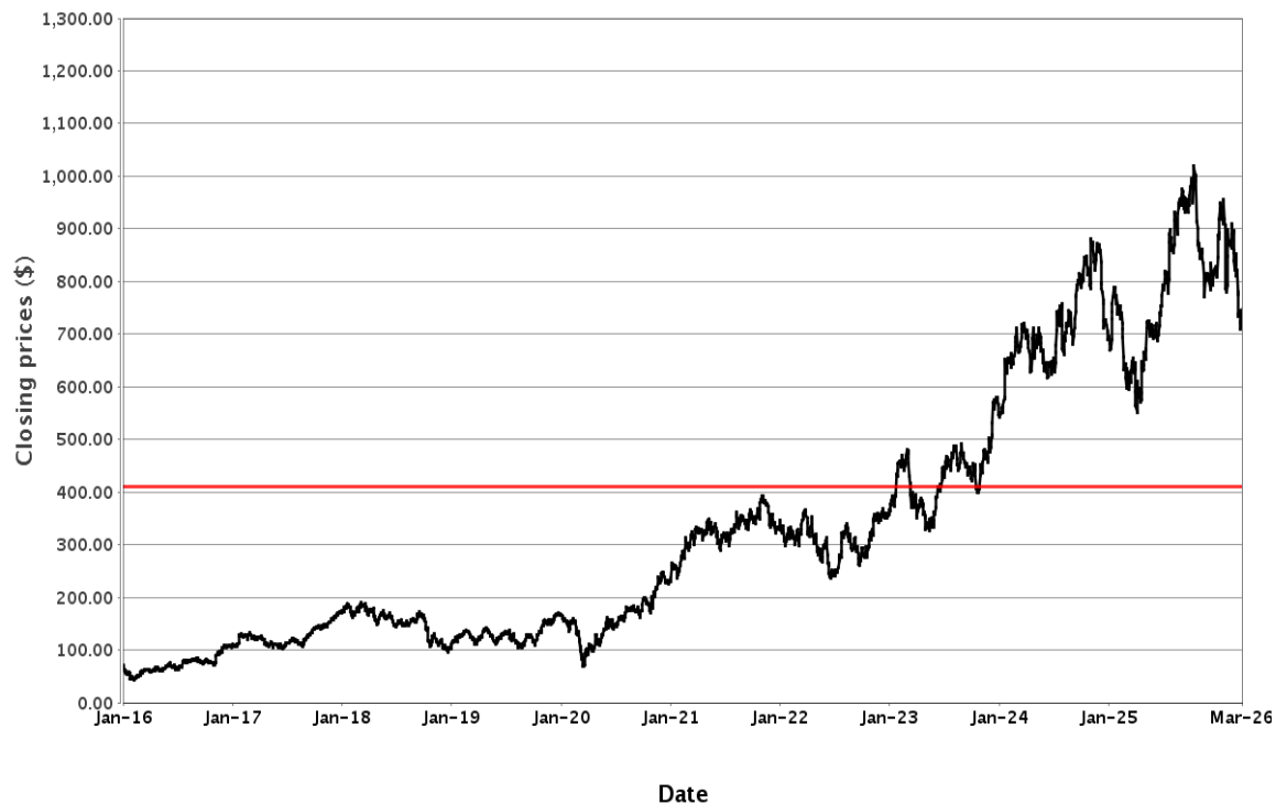
Common Stock of United Rentals, Inc.

PAST PERFORMANCE IS NOT INDICATIVE OF FUTURE RESULTS.