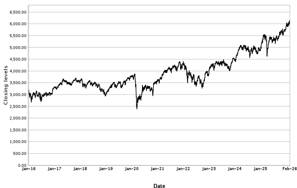
EURO STOXX 50® Index

PAST PERFORMANCE IS NOT INDICATIVE OF FUTURE RESULTS.